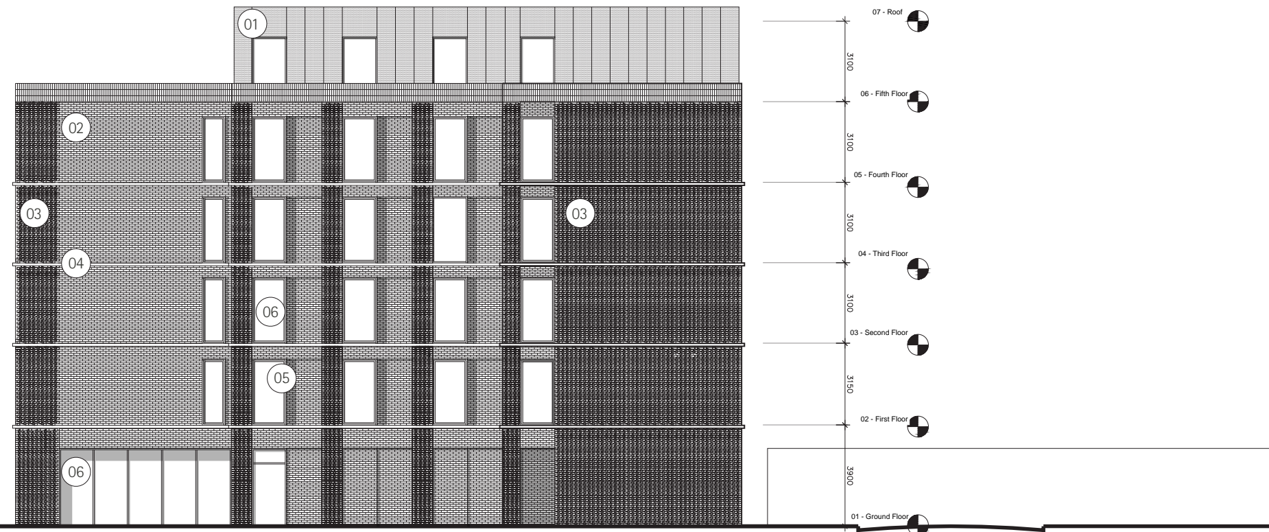
Scale 1:200 – East facing elevation