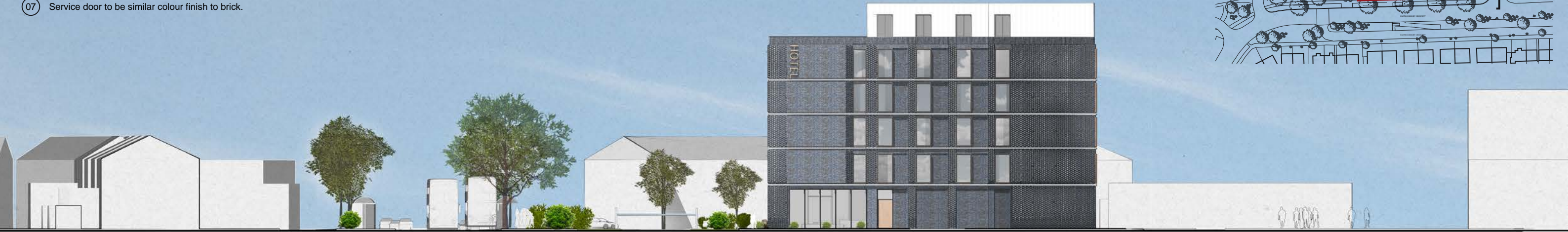
Site impression -East facing elevation